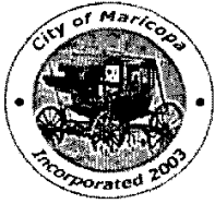
Exhibit A Public Works Fee Schedule