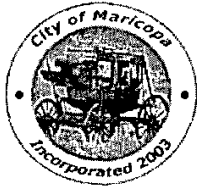
Exhibit A Planning Fee Schedule